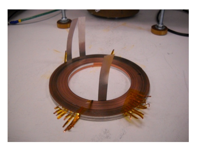
Figure 3: Test Coils

Manufacturer provided critical current value defined in terms of microvolt/cm for this conductor as 1\mu volt/cm for a short sample and self-field. For magnet use and therefore for test purpose we use a more stringent criteria in defining critical current at 0.1\mu volt/cm. This gave us the quench threshold set point of 1mV/coil because each coil has 100m conductor.