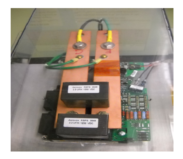
Figure 2: IGBT Switch.

The real time code running on PXI target logs and displays all voltage tap values. Since this is slow data more conventional filtering method of averaging over large number of power line cycles is used. The pre and post quench data of voltage taps values are recorded raw so that transient data is not lost and appropriate filter can be applied offline. PS control and reference signal for current ramp is also generated by this program.