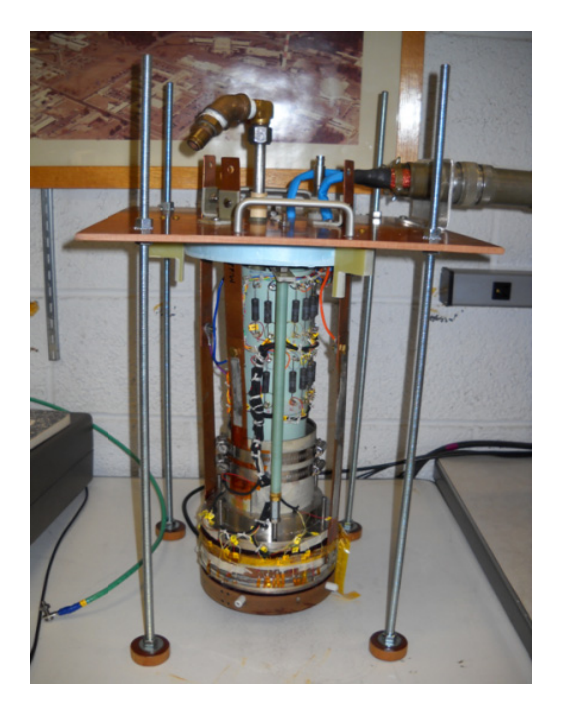
Figure 4: Coil Assembly